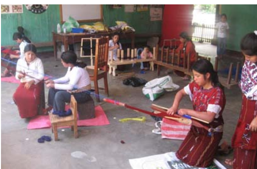
Weaving classes and workshop for teachers at Colegio Paxil, Nebaj, Guatemala