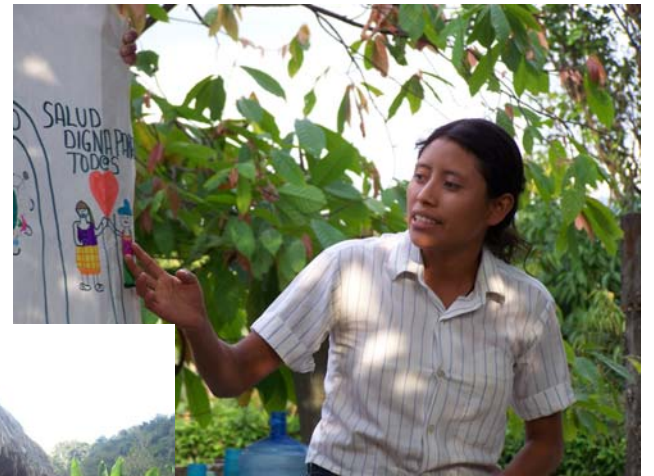
Health promoter in Chiapas