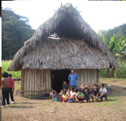
Principal with students in front of their school in Michbilixpú Guatemala