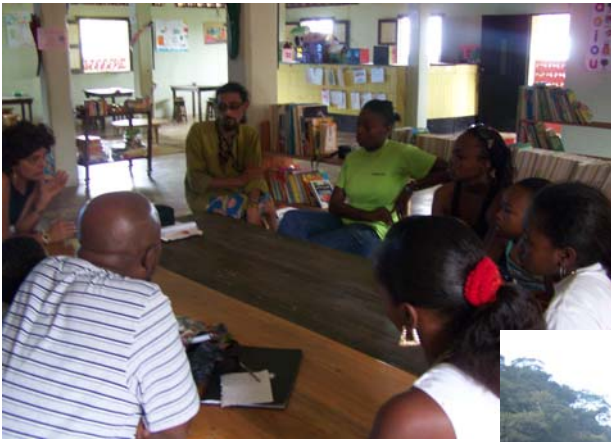
Meeting with parents and students from Livingston, Guatemala