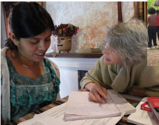
English language program volunteer works with a university student