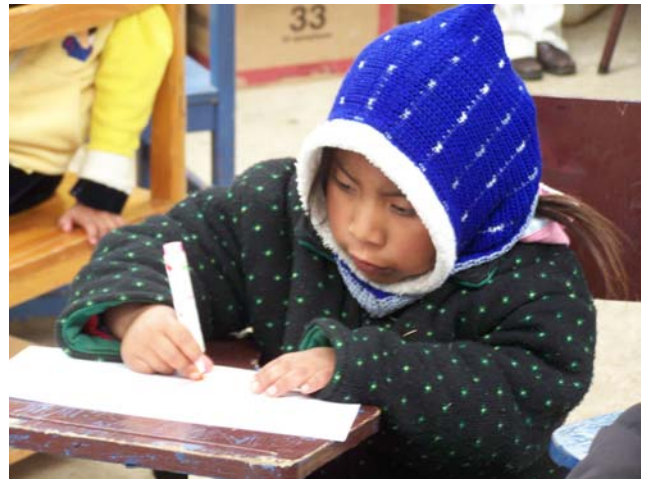
University student and grade school student at work in Chiapas