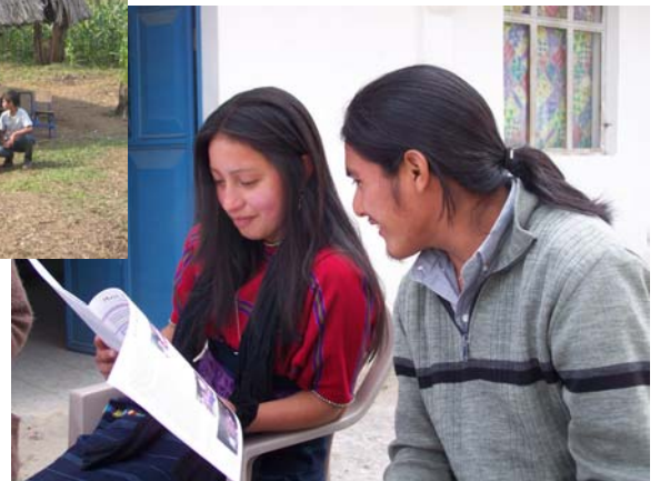
High school students from Cajolá, Guatemala